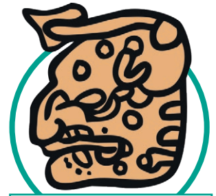
The Maya logogram for b'alam – jaguar

The Maya writing system, used to write several different Maya languages, was made up of over 800 symbols called glyphs. Some glyphs were logograms, representing a whole word, and some were syllabograms, representing units of sound. They were carved onto stone buildings and monuments and painted onto pottery. Maya scribes also wrote books, called codices , made from the bark of fig trees. Only priests and noblemen would know the whole written language.