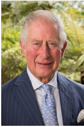
King Charles III