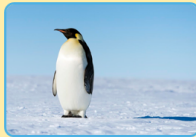
Emperor Penguin

Emperor penguins are the biggest penguins in the world. They have a special flap of skin above their feet where they keep their egg (and then their chicks) warm and off of the cold ground.