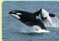
Orcas (killer whale)

Orcas are one of the fiercest predators in the sea. They eat seals, sea lions, penguins, squid, sea turtles, whales and even sharks. They have a thick layer of blubber to protect them from the cold water.