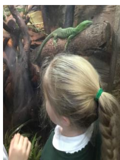
LKS2 Visit to Tropical World