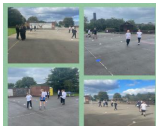
Orienteering and active maths in UKS2