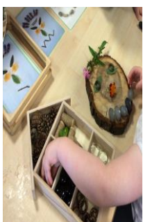
Autumn art in Nursery